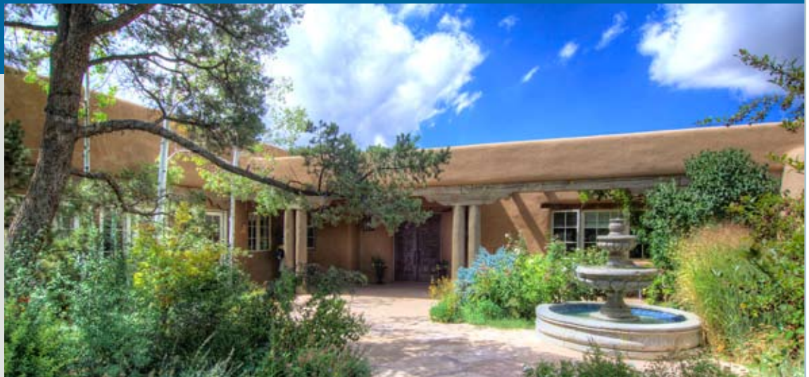
This month's distinctive property, Cerro De La Paz. Read more on page 4.